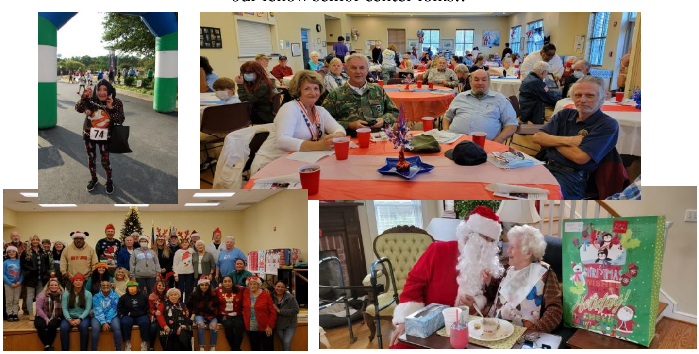
Dare County Center resumed annual celebrations in late 2021. Participants enjoyed being able to attend the Dare to Scare 5K, Veteran's Celebration, Annual Toy Drive and 12 Days of Christmas with Dare County Seniors.

It is a very simple way to share and highlight your hard work while giving fresh ideas to our fellow senior center folks!!